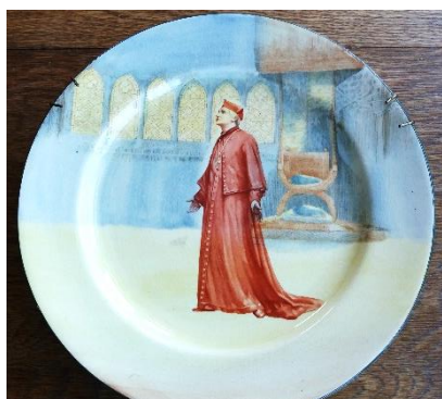
plate featuring Cardinal Wolsey, who rose to great power under Henry VIII before failing to get the king an annulment of his marriage to Catherine of Aragon. He was to be tried for treason, but

A plate was the topic for this group's January meeting, including this more than 100 year old Royal Doulton